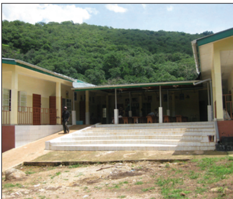
Nar Sarah Clinic now has a beautiful new Christensen Medical Building, complete with a pharmacy.