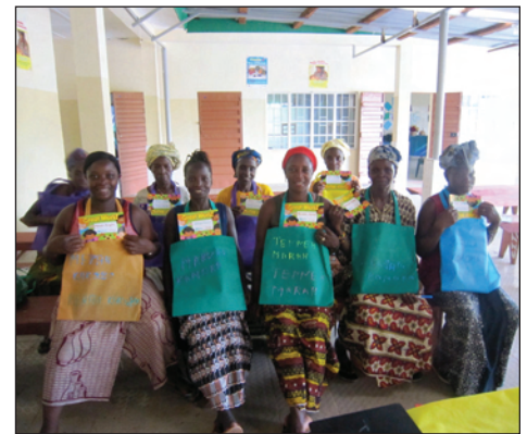
Proud Women of the Adult Literacy program.