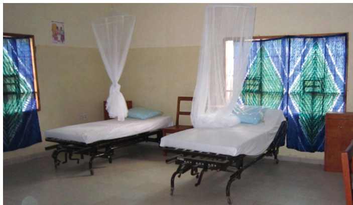
Chistensen Medical Building Opens