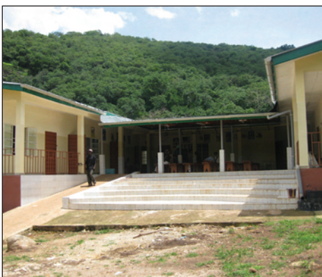
Nar Sarah Clinic now has a beautiful new Christensen Medical Building, complete with a pharmacy.